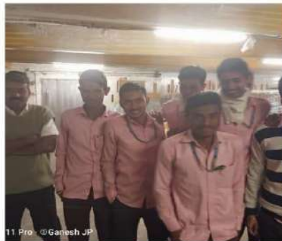
11 Pro