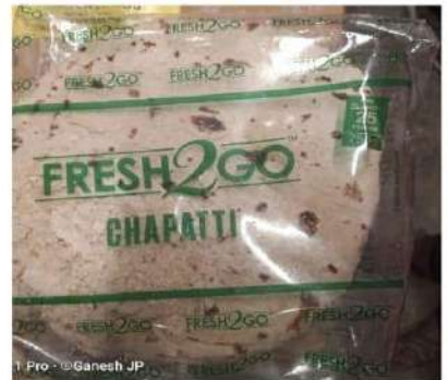
11 Pro