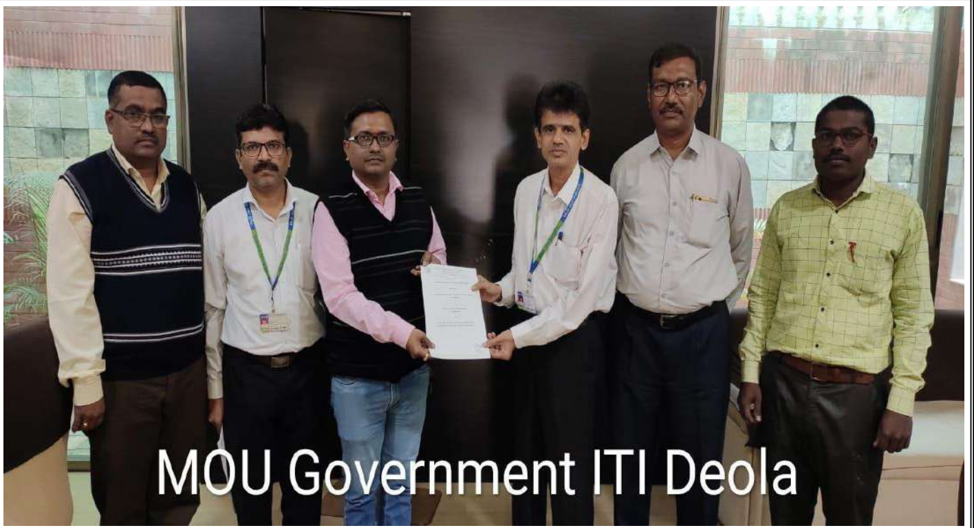
MOU Government ITI Deola