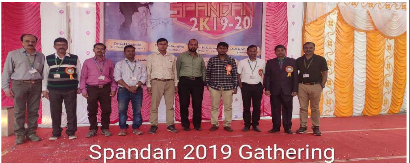
Spandan 2019 Gathering