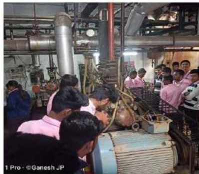
11 Pro - ©Ganesh JP