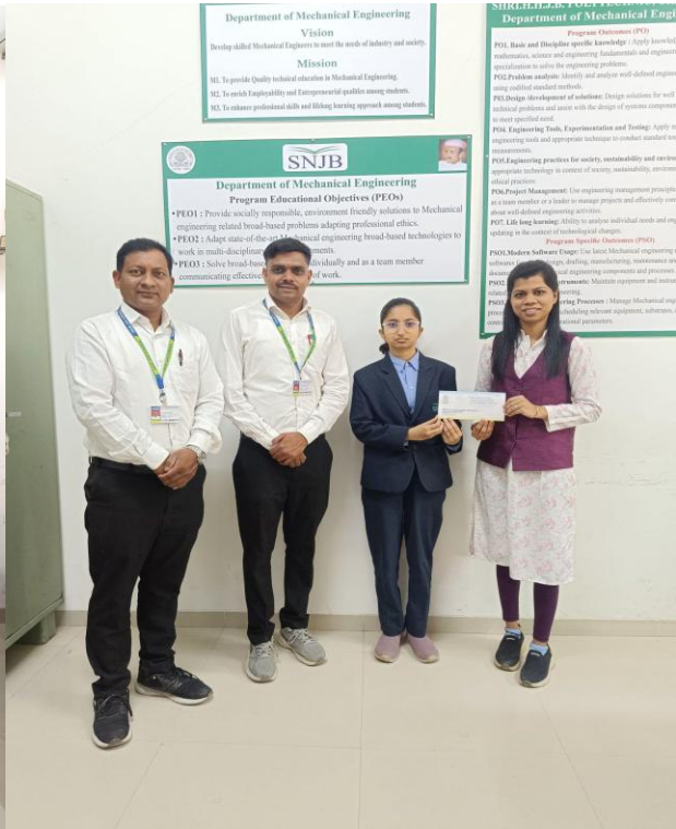
Prize distribution of Winners