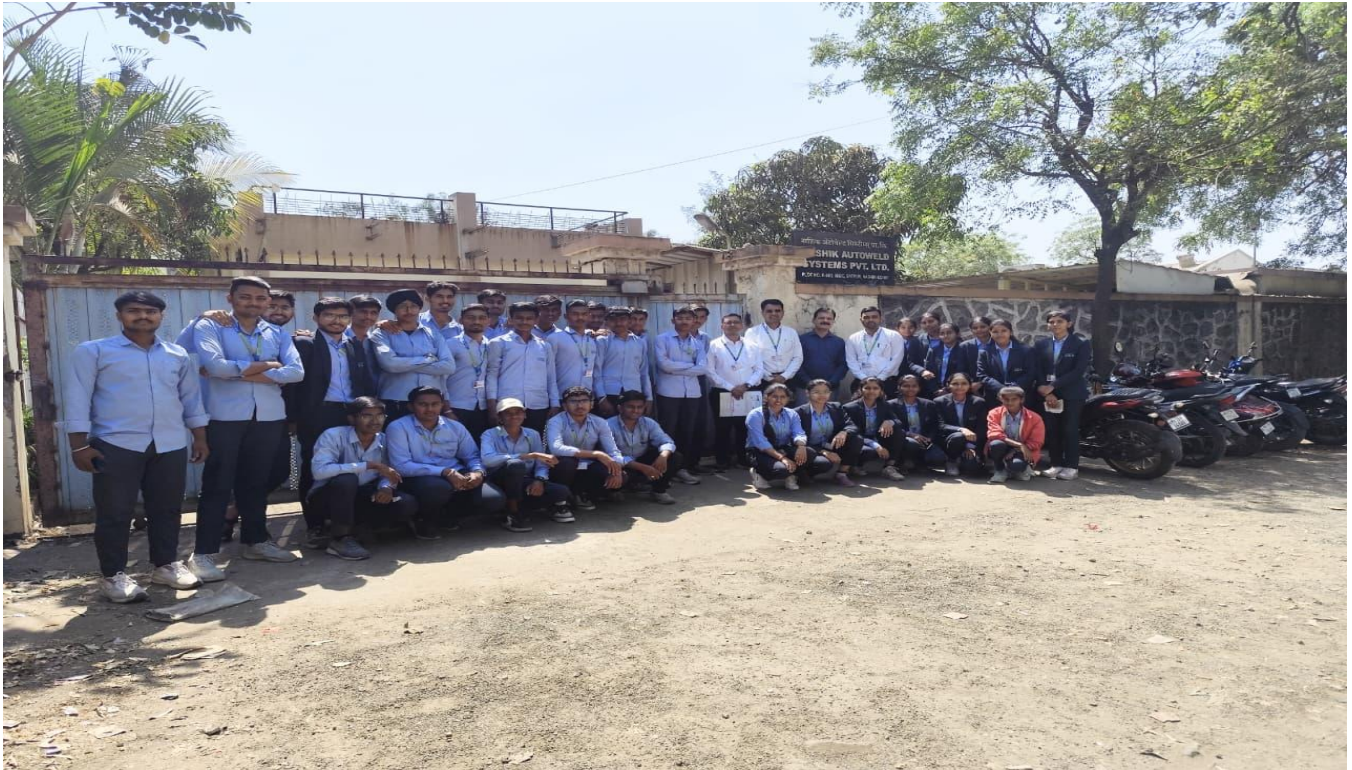
Photograph of Industrial Visit