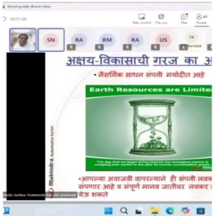
Photograph of FDP