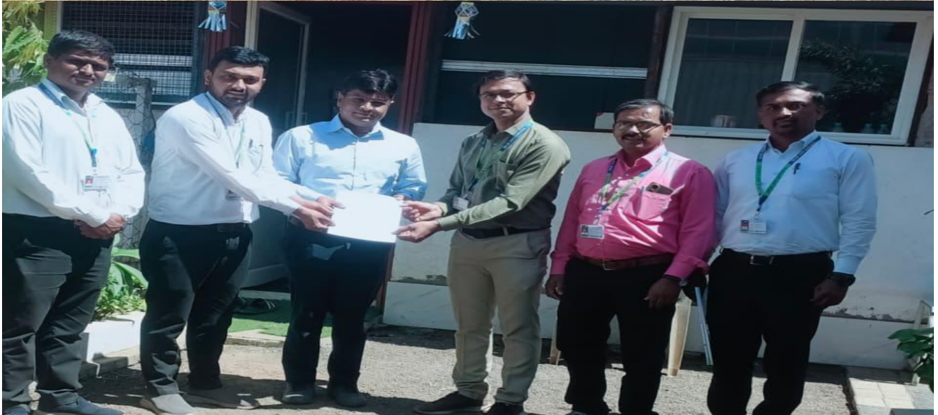
Photograph of Industrial Visit