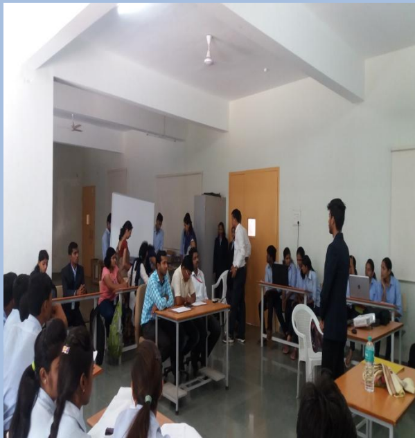
Participants of Competition