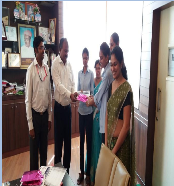
Felicitation of Winner Team