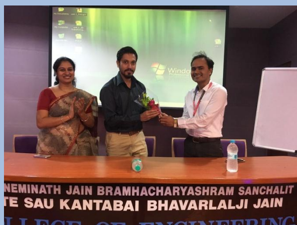
Felicitation of Resource Person