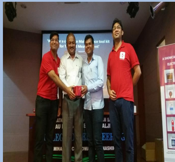
Felicitation of Winner