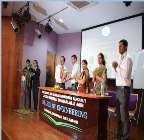
Felicitation of Resource Person