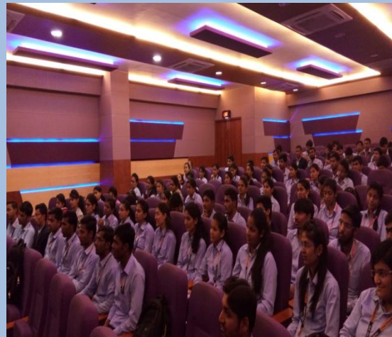
Participant in Workshop