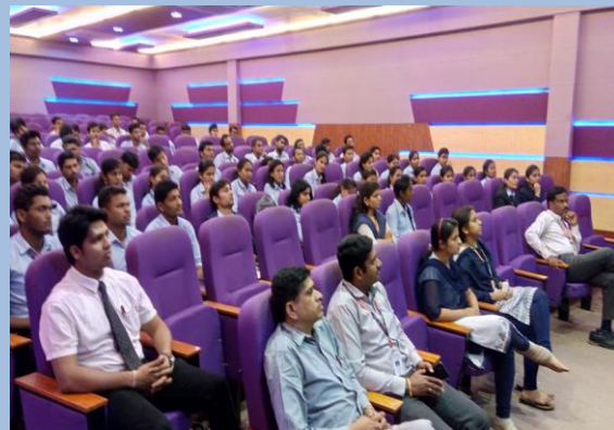
Participant in Expert Talk