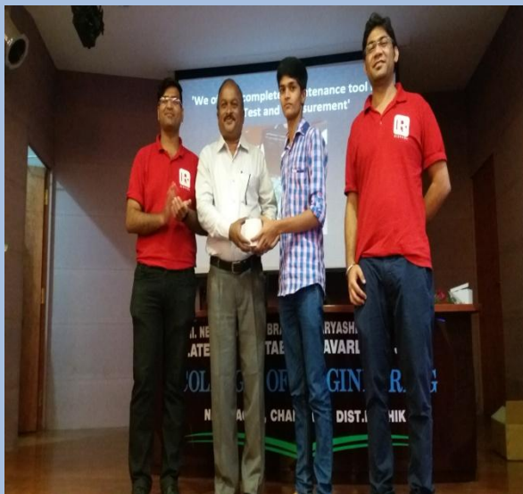
Felicitation of Winner

Participants: TE & BE (E &TC) Students only.