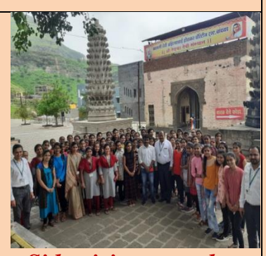
Side visit at renuka mata mandir,ganapati mandir and chandreshwari for FE students with principal Sir.